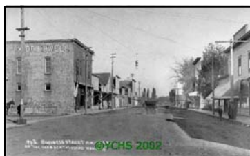
Amity—Trade Street Looking North

The Oregonian's Handbook of the Pacific Northwest, c. 1894