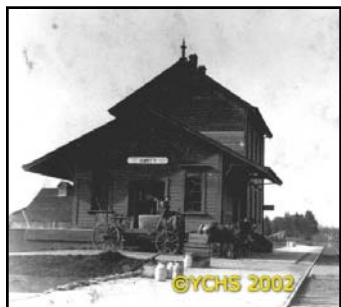
Amity Train Depot

Amity, Oregon—located in Yamhill County, but a short distance from the southern boundary, situated on a level plain and partly surrounded by a low range of hills, is the town of Amity. It is on the line of the West Side division of the Southern Pacific railroad, 57 miles south of Portland, and is within two and one-half miles of the line of the narrow-gauge system of the same company. Amity thus enjoys exceptional facilities for railroad connection with Portland and the larger valley towns. Two trains pass each way over the narrow-gauge lines daily, and one passenger train from the north and south stops at Amity's depot on the main line of the Southern Pacific.