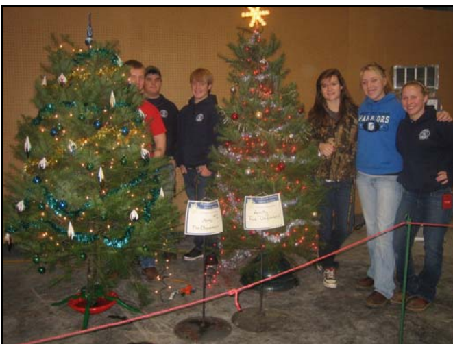
The Amity Fire Department and young volunteers decorating their Christmas trees