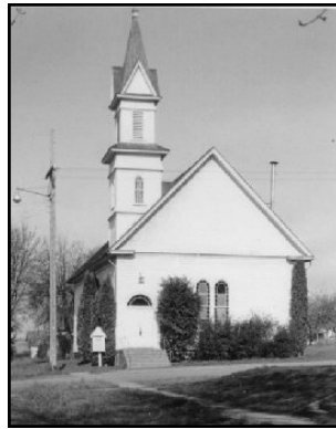
Historic Photo of the Poling Church

Spring is just around the corner and so is Farm Fest.