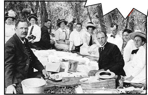
Period costumes encouraged!

NEEDED Volunteers, as well as donations of Cakes, Cupcakes, and Pies for various activities.