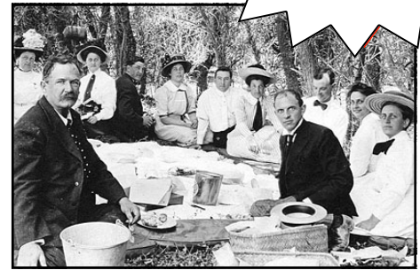
Period costumes encouraged!

NEEDED Volunteers, as well as donations of Cakes, Cupcakes, and Pies for various activities.