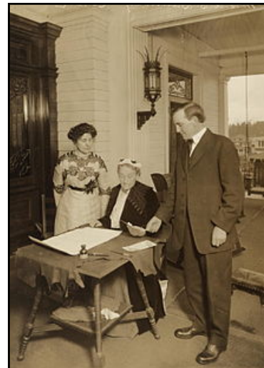
Abigail Scott Duniway signing the suffrage amendment.