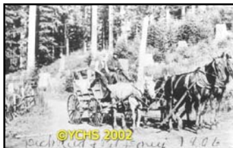
Stagecoach at Trask Mountain 1906

In July, 1901, a stage struck a rock just east of the Trask Toll Gate. The driver was thrown off to the ground, the four horse team ran away down a steep hill and the whole rig ended in an awful pile-up. At least three men were injured and one of them died there beside the road. In September, 1901, the outgoing North Yamhill and Tillamook stage, on a Tuesday, upset nine miles west of Yamhill, at Fairdale, about 11 o'clock that evening. A commercial traveler