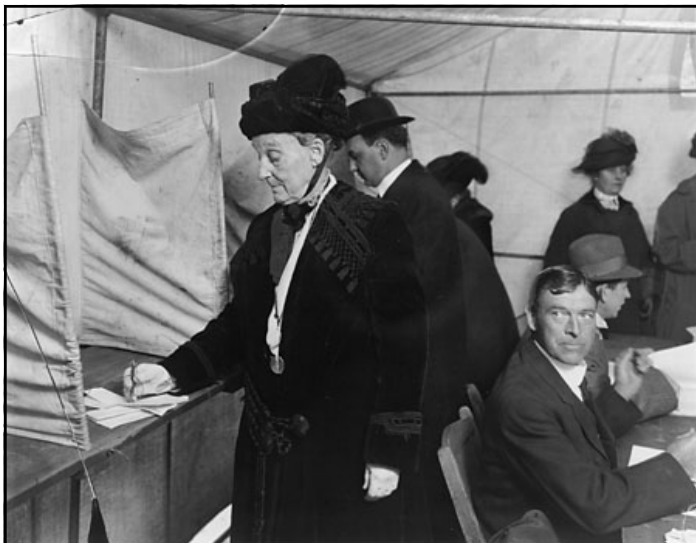
Abigail Scott Duniway and her historic vote.