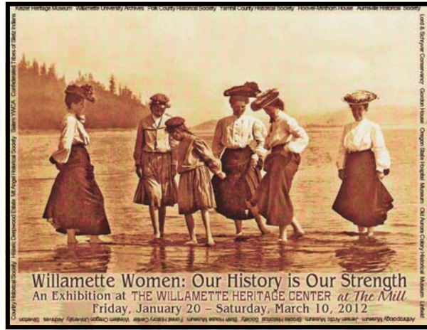
Willamette Women: Our History is Our Strength An Exhibition at THE WILLAMETTE HERITAGE CENTER at The Mill Friday, January 20 - Saturday, March 10, 2012