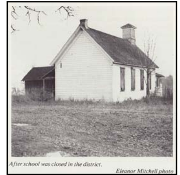
Hutchcroft One-room Schoolhouse

Schools of Old Yamhill by Yamhill County Historical Society