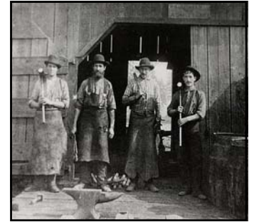
Blacksmiths at the Oregon Railway in Dundee circa 1880.

There's smoke and fire and dirt in a blacksmith shop and that is part of the interest, he