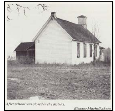
After school was closed in the district.

Schools of Old Yamhill by Yamhill County Historical Society