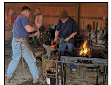
YCHS Blacksmith Shop hard at work!

Please call Steve Gossett, at (503) 616-1501, to volunteer for any of these activities.