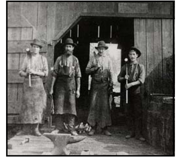
Blacksmiths at the Oregon Railway in Dundee circa 1880.

There's smoke and fire and dirt in a blacksmith shop and that is part of the interest, he