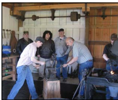
By Tami Spears