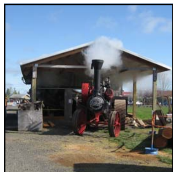
By Tami Spears

Pam (503) 434-0490, pwatts@onlinemac.com or Cliff (503) 435-9700