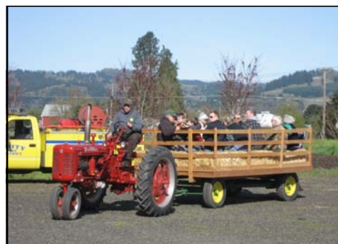
By Tami Spears