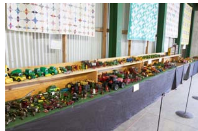
New this year—toy tractor and quilt displays!