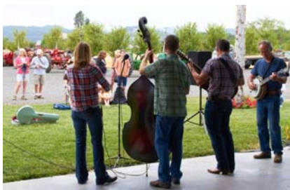
Local musicians "Yambillbillies" entertain the crowd with old-style music