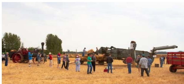
The "Harvest Crew" using the 1912 Peerless steam traction engine and Rumley threshing machine to harvest oats