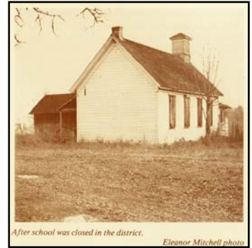
Hutchcroft One-Room Schoolhouse