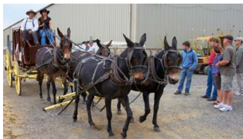
Stagecoach rides—a popular item at Harvest Fest this year!