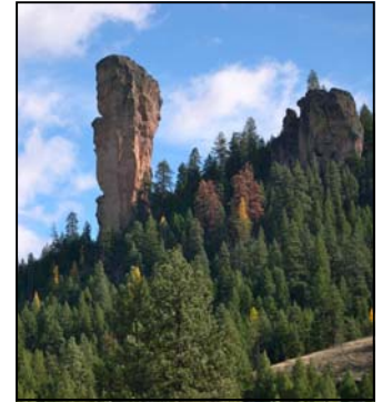
Stain's Pillar is said to have been visible from the clearing where the skeletons of 6 horses tied to a log were found. A fortune in stolen gold bricks is thought to be in the area.

In those days people took excellent care of their horses, and good saddles were expensive. No matter how bad