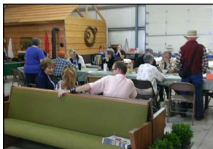
Appraisal table with people sitting at the benches waiting their turn