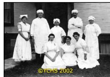
McMinnville Doctors and Nurses 1911

1890 —Enactment of the Narcotic and Pharmacy Acts and the formation of the Oregon State Pharmaceutical Association.