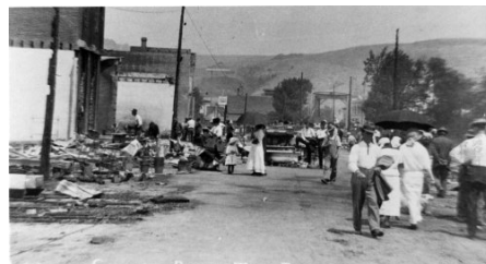
After the 1913 fire

Today, we have building codes that provide greater protection. Sometimes we resent those codes, but they protect us from fires like the devastating Sheridan infernos. We also have first-class fire departments whose personnel are well-trained in fire control. Thanks to lessons learned from the past, we are much safer.