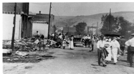
After the 1913 fire

Today, we have building codes that provide greater protection. Sometimes we resent those codes, but they protect us from fires like the devastating Sheridan infernos. We also have first-class fire departments whose personnel are well-trained in fire control. Thanks to lessons learned from the past, we are much safer.