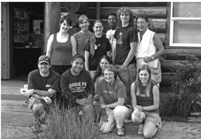
D. Hosington / YCHS

Students participating in George Fox University's Share Day activities visited the Yamhill County Historical Society on September 5, 2007 and provided volunteers with much needed assistance in tidying the Lafayette site, and packing up items left from the garage sale at the McMinnville site.