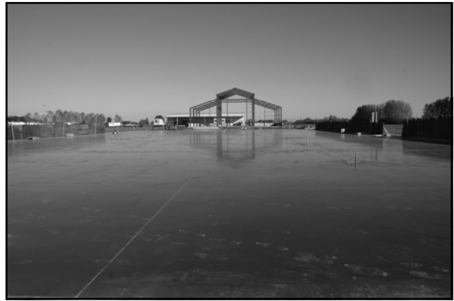
K. Huit / YCHS

A stop at the Log Cabin this month really puts one in an autumn mood. The ladies have cleverly used artifacts like old fruit jars, other dishes and old linens to create a fall atmosphere. Visitors who come for tours will find it very inviting as will those who come for research reasons.