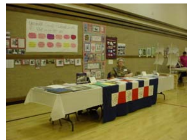
Marjorie Owens displays some of our beautiful quilts.

The goal of all this is to preserve and protect our artifacts to the best of our ability. Research into and funding for archival products to better preserve our artifacts has resulted in a flurry of activity in our museum this summer and the work is far from done.