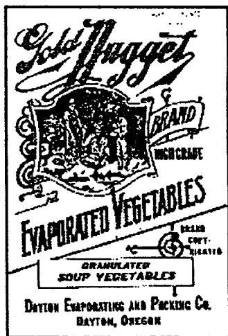
Label from 2 ounce carton of Gold Nugget dehydrated vegetables. About the size of a pack of cigarettes, the contents were sufficient to prepare a gallon of soup.

With frozen foods rapidly dominating the market during the 1950's, the Dayton Evaporating and Packing Co. plant discontinued dehydration operations to become a receiving station for produce destined for freezing elsewhere. Thus-closed a major chapter in the County's rich agricultural history.