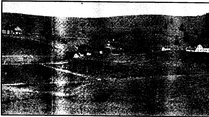
View of the tract purchased by Bishop Scott Academy reproduced from a 1910 Walnut Grove Co. sales brochure.

He further suggested that in addition to purchasing a site for the academy, sufficient additional land should be included upon