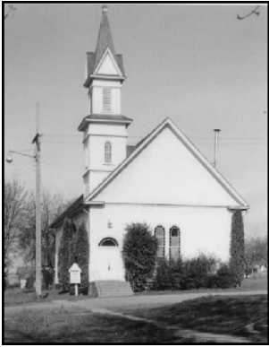
Historic Photo of the Poling Church