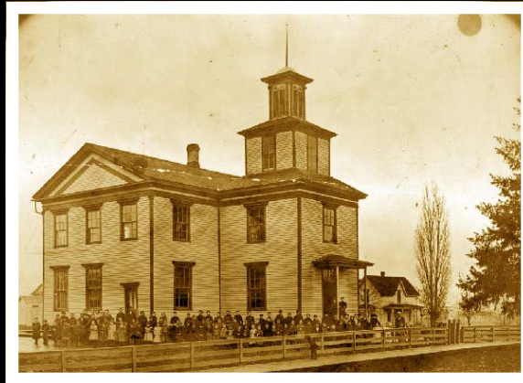
Lafayette School House ca. 1874