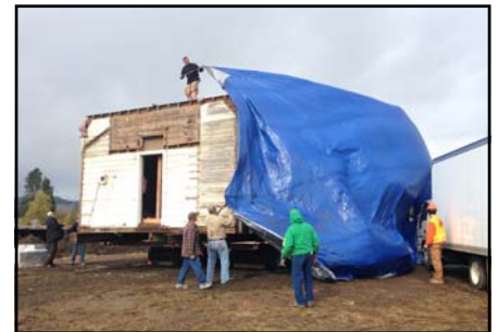
Tarping the roof