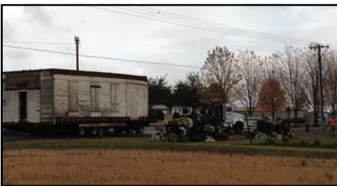
Turning into the Yambill Valley Heritage Center