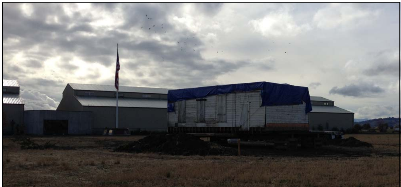
The Hutchcroft One-Room Schoolhouse at its new home at the Heritage Center