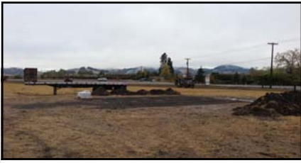
Foundation for the school at the Heritage Center