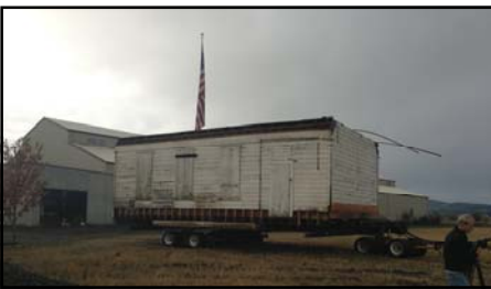
Driving into the field