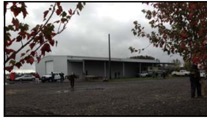
Excitement stirs as we see the schoolhouse approach