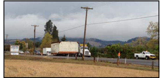
The Schoolhouse quickly crossing 99W onto Durham Ln