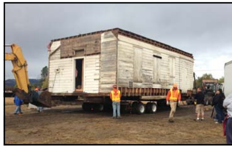
The Schoolhouse being positioned over the new foundation