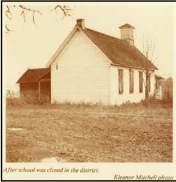
After school was closed in the district.