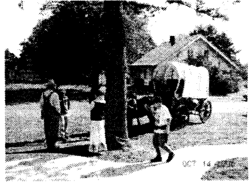
Above —these two mules gave numerous wagon rides to our Harvest Festival guests throughout the day. This is representative of the actual vehicles which traveled the Oregon Trail.