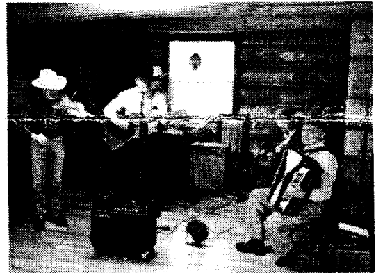
The two groups of talented Old Time Fiddlers added a lot to this years Harvest Festival, and we hope they can return next year.